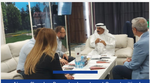
Ajman Chamber Promotes Investment Opportunities In Construction And Real Estate Sectors In Sarajevo