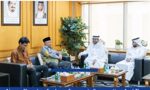
Ajman Chamber Explores Economic Cooperation And The .Development Of Trade Exchange With Indonesia