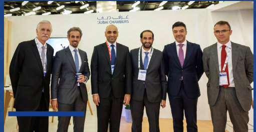
Ajman Chamber Participates In The World Chambers Congress In Geneva