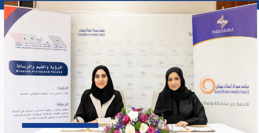
Cooperation between AJBWC and UAEMPF