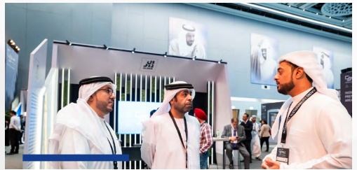
«Ajman Chamber participates in the «Make in the Emirates Forum