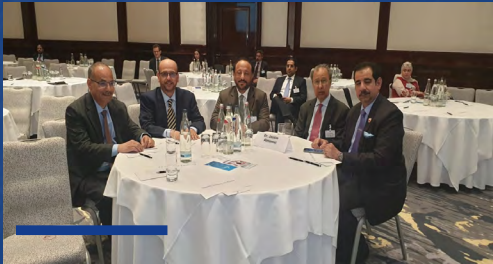
Ajman Chamber participates in the Arab-German Business Forum in Berlin