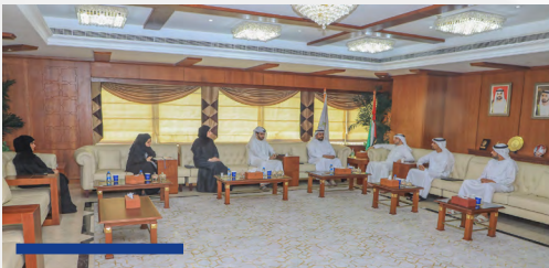
Ajman Chamber and Ajman Port are discussing joint cooperation to facilitate the customers's journey