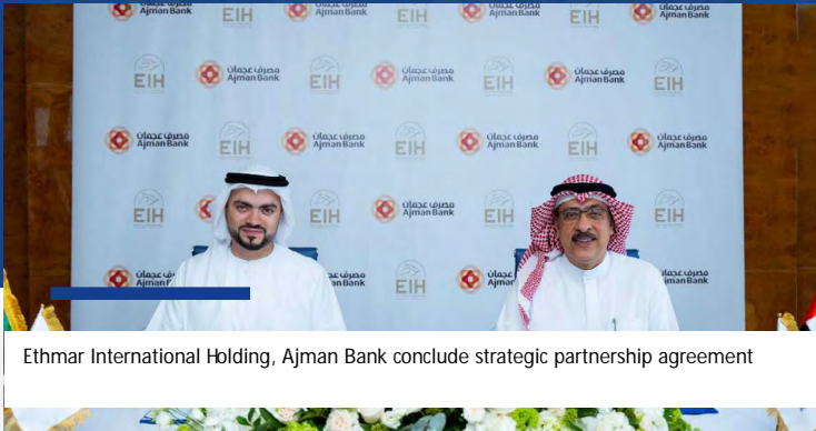
Ethmar International Holding, Ajman Bank conclude strategic partnership agreement