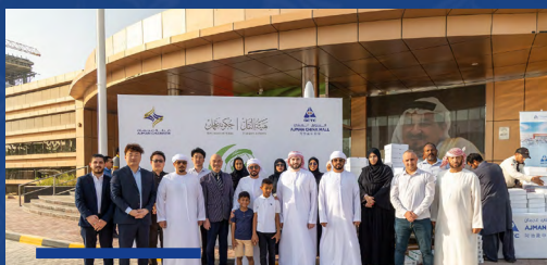
Distributing Iftar Meals» Initiative In Cooperation With The» Ajman China Mall