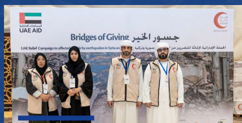
Ajman Chamber participates in the «Bridges of Giving» campaign