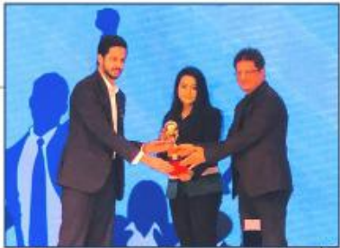
Young Entrepreneur's Award