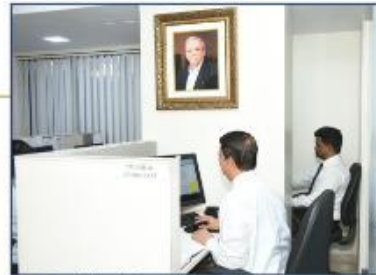
Technical Consultant Department