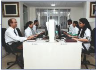
HR Team 1 & 2