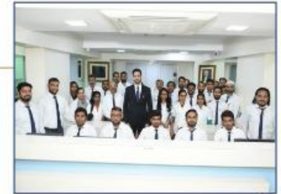
Head Office Staff with MD