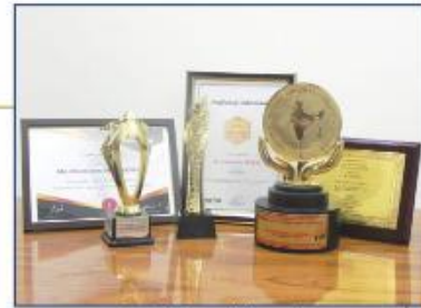
Iconic Brand Award