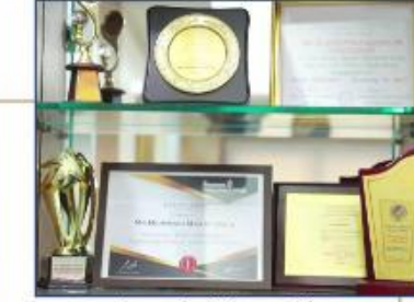
Rewards & Recognition