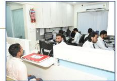
Visa Stamping & Deployment Team