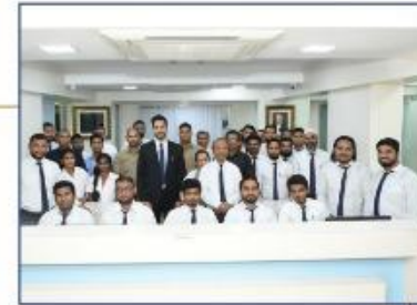
Head Office Staff with MD