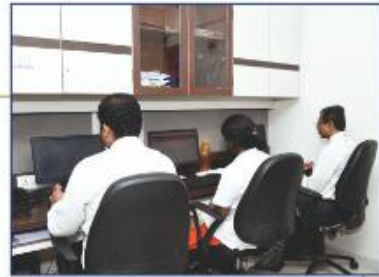
HR Team 6