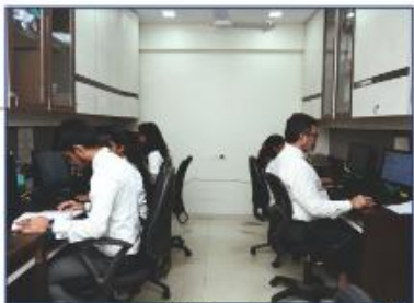
HR Team 7