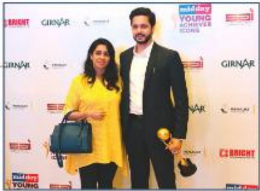
Midday Entrepreneur's Award