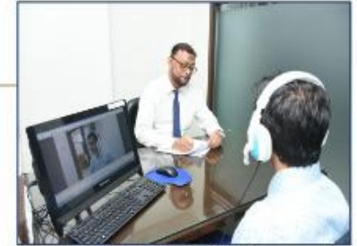
Online Interview Cabin