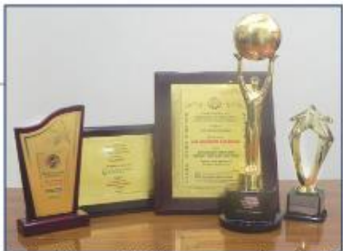
The Honourable Businessman Award