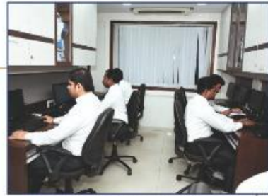
HR Team 3 & 4