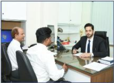
Managing Director's Cabin