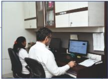
HR Team 5