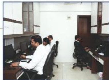
HR Team 8