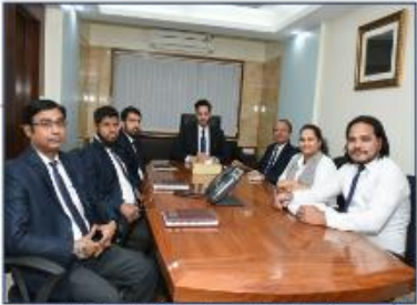
MD with Departmental Heads