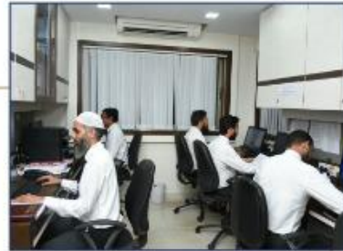
Accounts & Finance Department