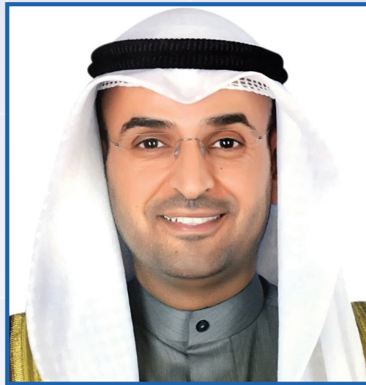
H .E. Dr. Nayef Falah Al-Hajraf

Supported by Cooperation Council for the Arab States of the Gulf (GCC -SG)