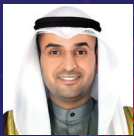
H. E. Dr. Nayef Falah Al-Hajraf Secretary General of the Cooperation Council for the Arab States of the Gulf (GCC -SG)

The Cooperation Council for the Arab States of the Gulf (GCC -SG)