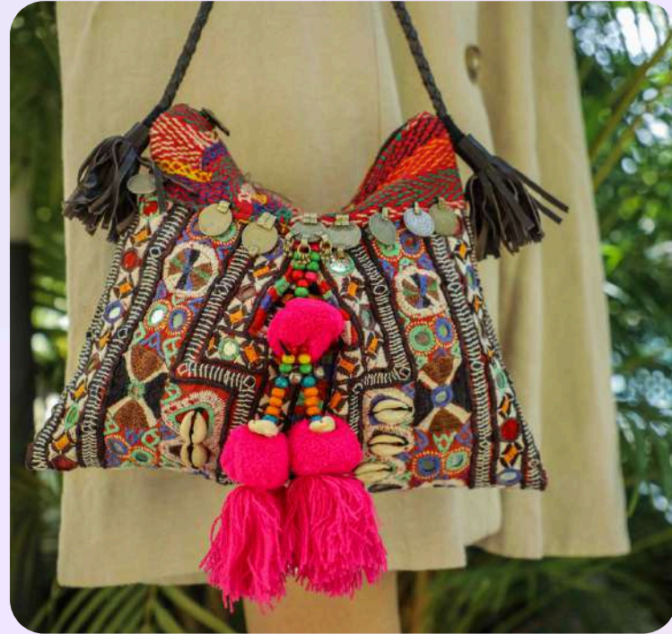
BANJARA SLING BAGS