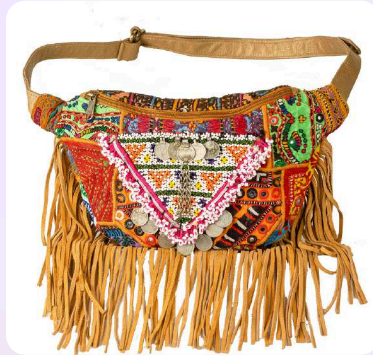
BANJARA FENNY BAGS