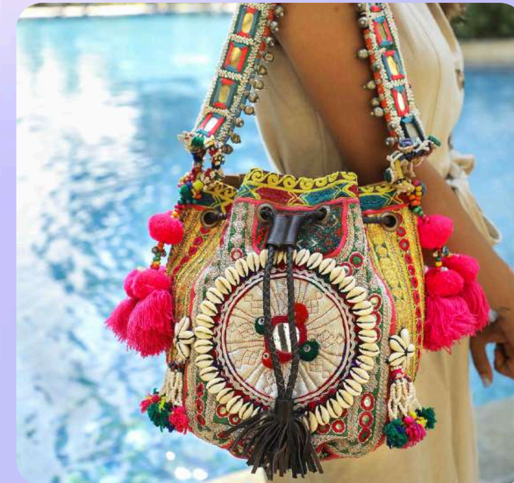
BANJARA POTLI BAGS