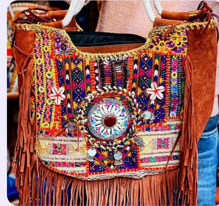
BANJARA TOTE BAGS