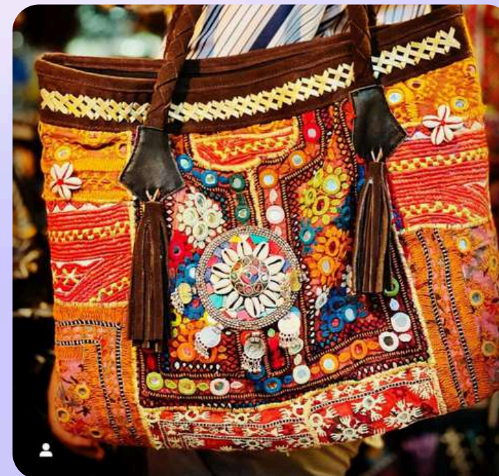
BANJARA SHOULDER BAGS