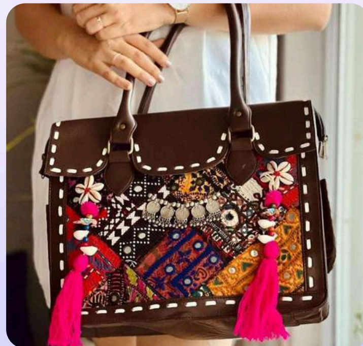
BANJARA LEATHER BAGS