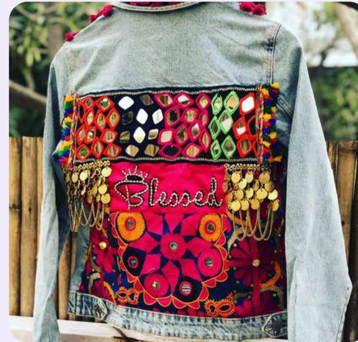
BANJARA DENIM JACKETS