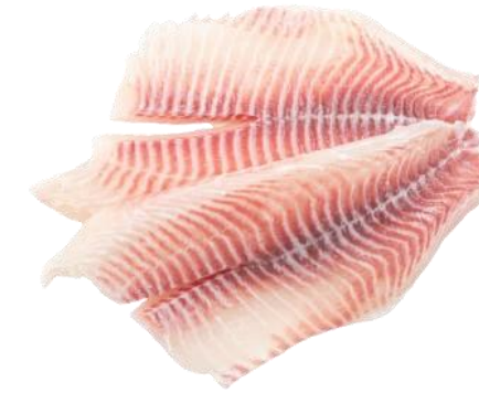
Fillet Non-Deep Skin