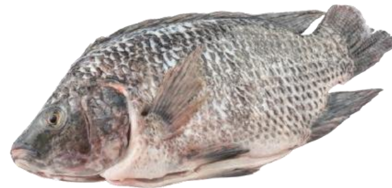
Whole Gilled Guted Scaled Black Tilapia