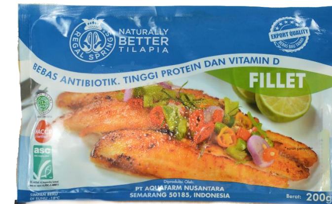
Product Marketed Domestically