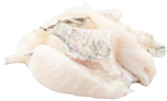
Trimming Belly Meat