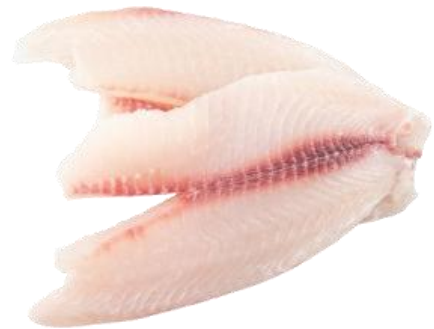
Fillet Deep Skin