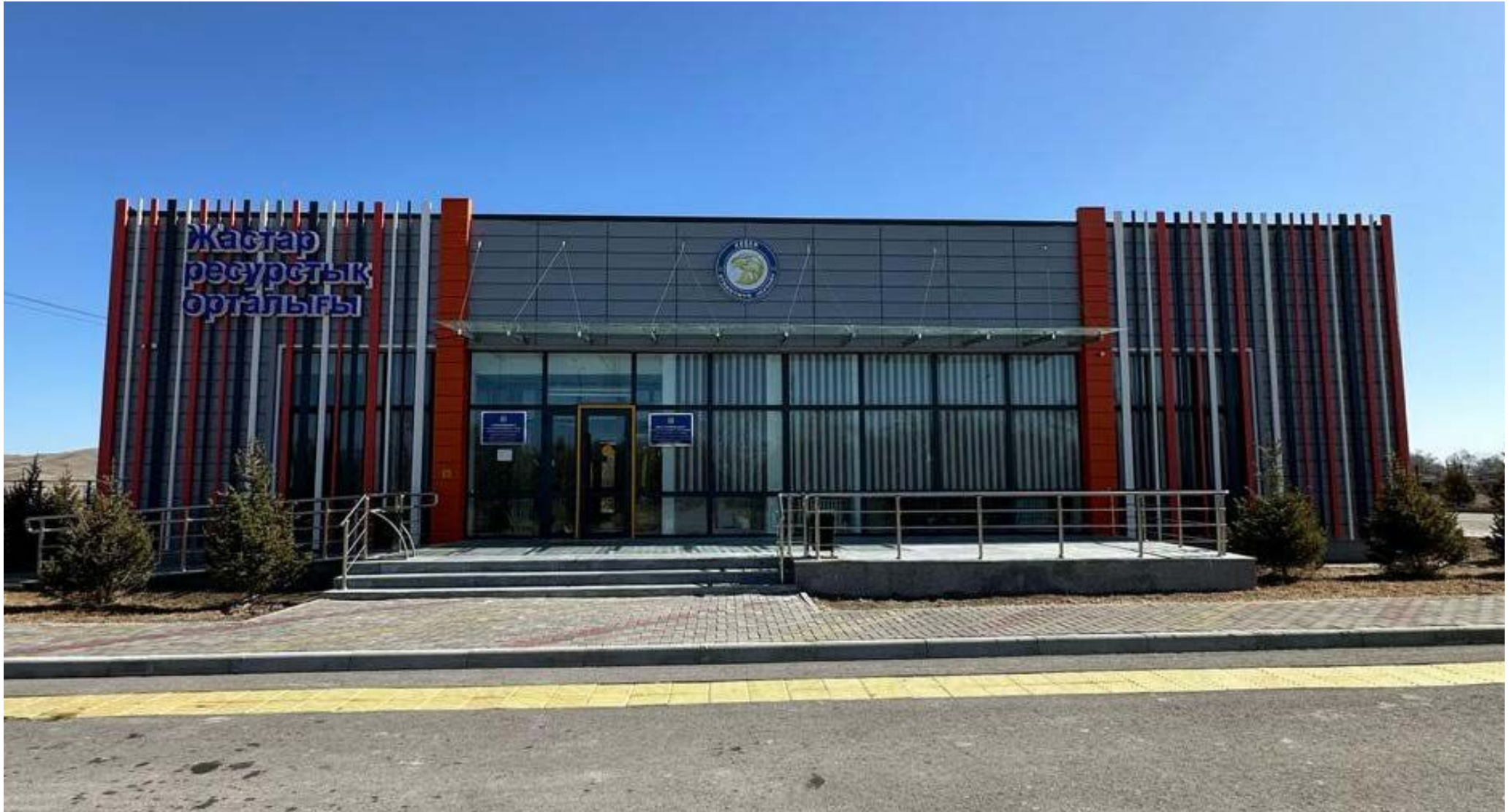
Youth Resource Center