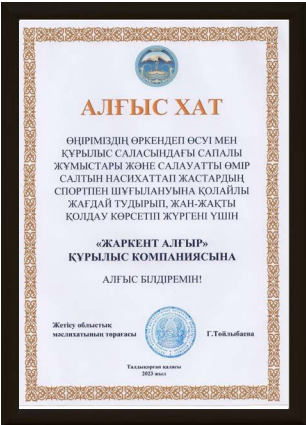
Thank you letter