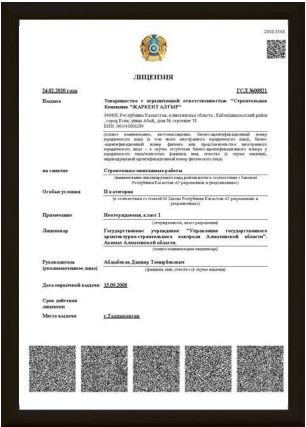
Construction and installation works