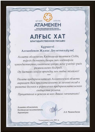
Thank you letter